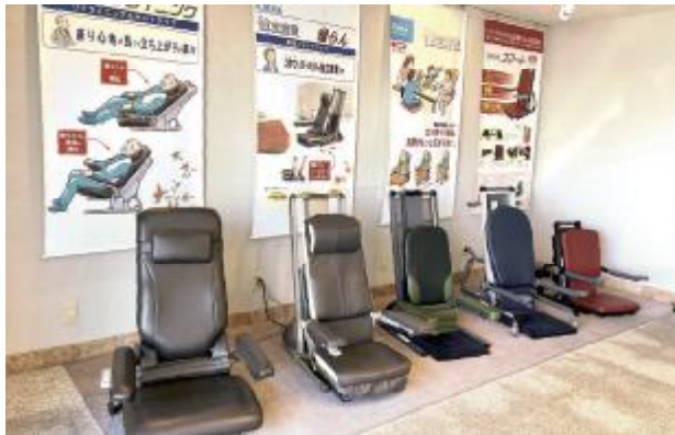
Their original product "DOKURITSU SENGEN" series