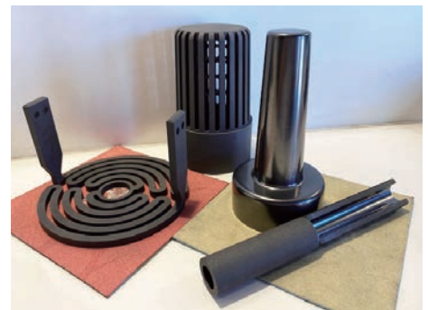
Heater, forging jig

Such "visualize" plant utilization by installing AI camera, they're working on strengthen production control by improving QCD. "Productivity is rocketing thorough these efforts." the president Tanaka says proudly. Carbon is consumable, but they never forget environmental consideration such reuse as carburizer by receiving used products then crush them to pieces. From now, they also focus on proposing saving energy with methods of extending lifecycle and unique development of new material which combine material apart from carbon. They bring development to developers of carbon products into perspective.