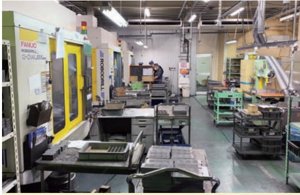
Production line with AI camera